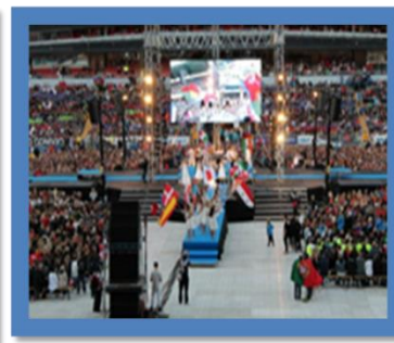
Gothia Cup Opening Ceremony

For more information about the tournament including age groups, rules and regulations and touristic/sightseeing information please visit the tournament website: www.gothiacup.se .