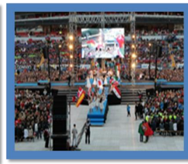
Gothia Cup Opening Ceremony

For more information about the tournament including age groups, rules and regulations and touristic/sightseeing information please visit the tournament website: www.gothiacup.se .