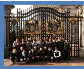
Wisconsin Lutheran College