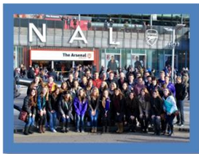
Arsenal Game Albion College

HAMPTON COURT PALACE: Hampton Court Palace is a royal palace in the London Borough of Richmond upon Thames, Greater London, in the historic county of Middlesex; it has not been inhabited by the British Royal Family since the 18th century.