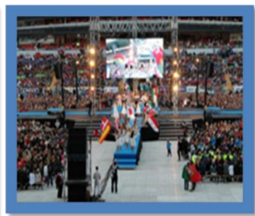
Gothia Cup Opening Ceremony