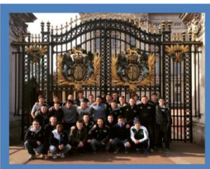
Wisconsin Lutheran College