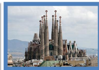
La Sagrada Familia