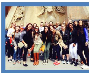
University of Mary