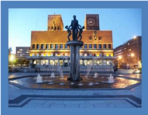
Oslo City Centre