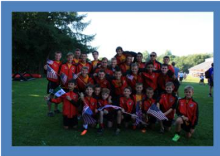
Dallas Texans Boys