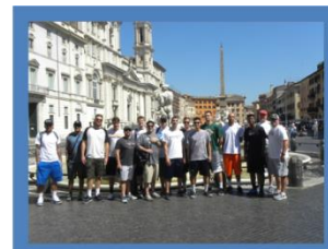
SCIAC All Stars

*The above itinerary is a provisional/suggested itinerary and can/will change depending on your group's specific wishes, the final game schedule for your team(s) and any pro game visit(s) incorporated for your group. Sightseeing admission fees are not included in the prices but can be added and pre-booked based on your group's specific wishes. Consult us for more information.