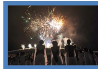
Donosti Cup Opening Ceremony