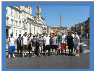
SCIAC All Stars

*The above itinerary is a provisional/suggested itinerary and can/will change depending on your group's specific wishes, the final game schedule for your team(s) and any pro game visit(s) incorporated for your group. Sightseeing admission fees are not included in the prices but can be added and pre-booked based on your group's specific wishes. Consult us for more information.