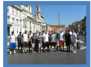
SCIAC All Stars

The Roman Forum: The Roman Forum is a rectangular forum (plaza) surrounded by the ruins of several important ancient government buildings at the center of the city of Rome. Citizens of the ancient city referred to this space, originally a marketplace, as the Forum Magnum, or simply the Forum. Located in the small valley between the Palatine and Capitoline Hills, the Forum today is a sprawling ruin of architectural fragments and intermittent archaeological excavations attracting 4.5 million sightseers each year.