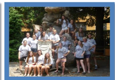
Lake Hill Storm SC

*The above itinerary is a provisional/suggested itinerary and can/will change depending on your group's specific wishes, the final game schedule for your team(s) and any pro game visit(s) incorporated for your group. Sightseeing admission fees are not included in the prices but can be added and pre-booked based on your group's specific wishes. Consult us for more information.