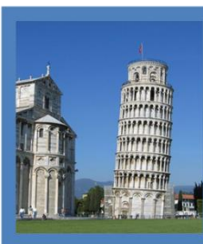
Leaning Tower of Pisa