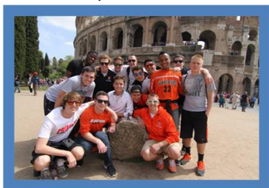
Wartburg College Men's Soccer