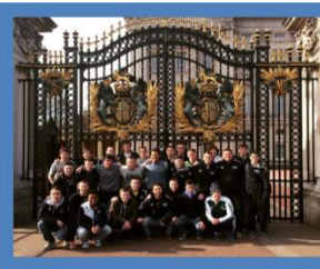
Wisconsin Lutheran College