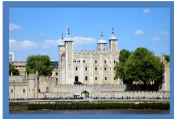
Tower of London