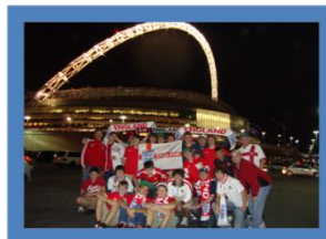
Glenn Falls High School