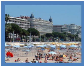
Beach in Cannes