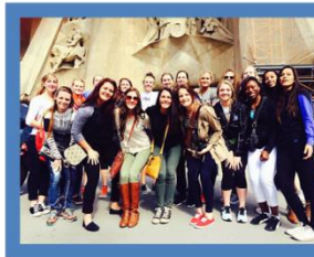
University of Mary