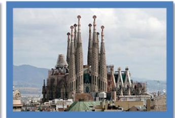
La Sagrada Familia