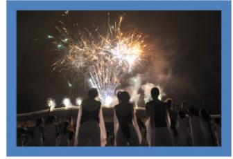
Donosti Cup Opening Ceremony