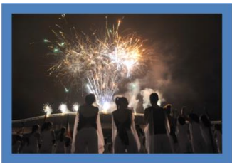
Donosti Cup Opening Ceremony