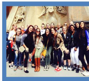
University of Mary