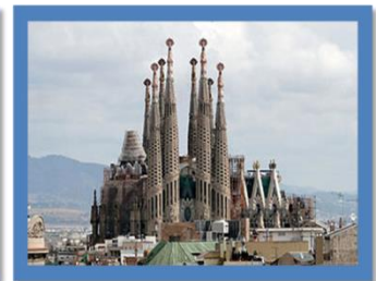
La Sagrada Familia