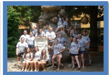
Lake Hill Storm SC