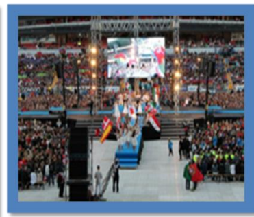
Gothia Cup Opening Ceremony

For more information about the tournament including age groups, rules and regulations and touristic/sightseeing information please visit the tournament website: www.gothiacup.se .