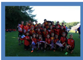
Dallas Texans Boys