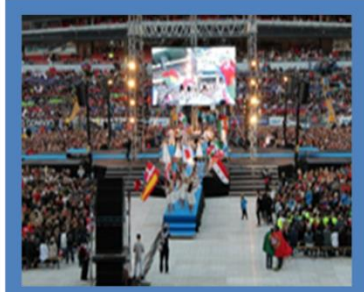
City of Gothenburg