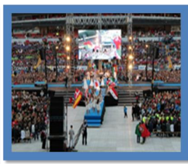
Gothia Cup Opening Ceremony

For more information about the tournament including age groups, rules and regulations and touristic/sightseeing information please visit the tournament website: www.gothiacup.se .