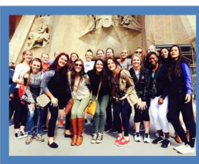
University of Mary