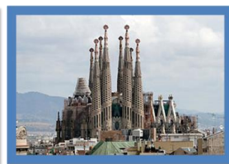
La Sagrada Familia