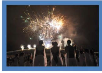
Donosti Cup Opening Ceremony