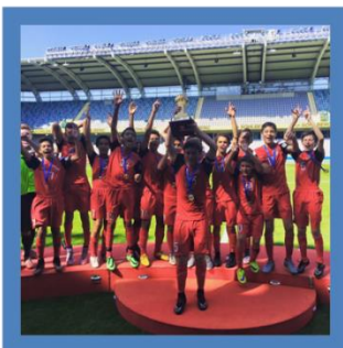
Dallas Texans Soccer Club