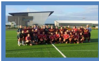
Ohio Wesleyan Soccer