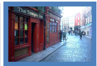
Streets of Dublin