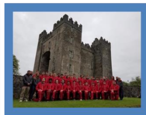
Fishers High School