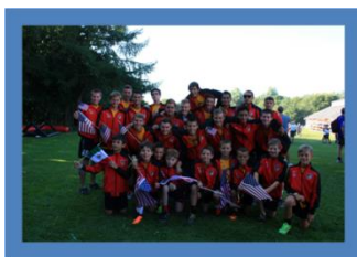
Dallas Texans Boys