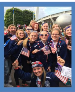
Norco Soccer Club