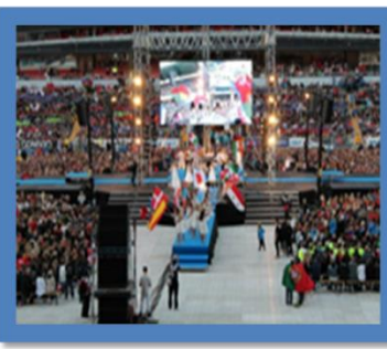
Gothia Cup Opening Ceremony

For more information about the tournament including age groups, rules and regulations and touristic/sightseeing information please visit the tournament website: www.gothiacup.se .