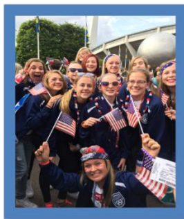
Norco Soccer Club