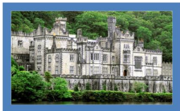
Galway Kylemore Abbey