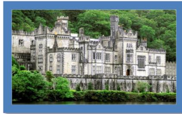
Galway Kylemore Abbey