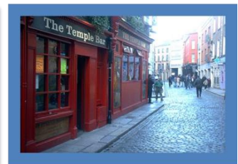
Streets of Dublin