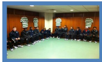
US Club Soccer id2 Program