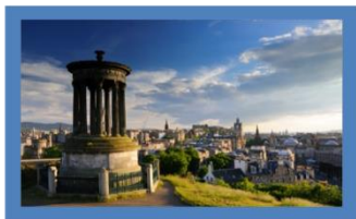
City of Edinburgh