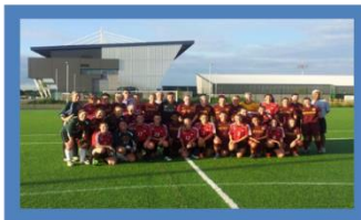
Ohio Wesleyan Soccer