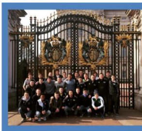
Wisconsin Lutheran College