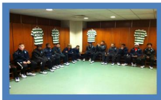
US Club Soccer id2 Program