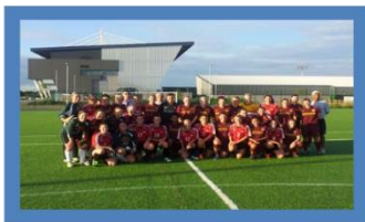
Ohio Wesleyan Soccer