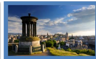
City of Edinburgh