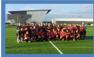
Ohio Wesleyan Soccer