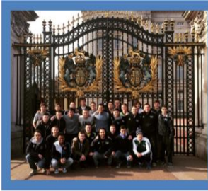
Wisconsin Lutheran College