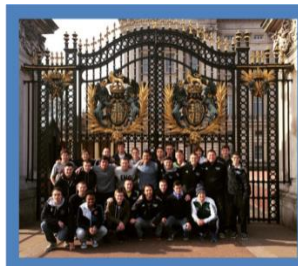
Wisconsin Lutheran College