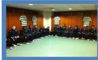
US Club Soccer id2 Program