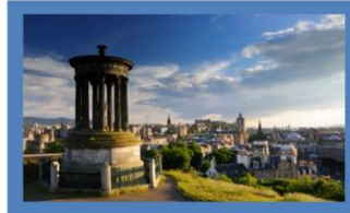
City of Edinburgh