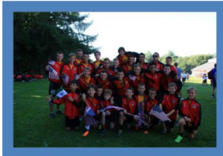
Dallas Texans Boys