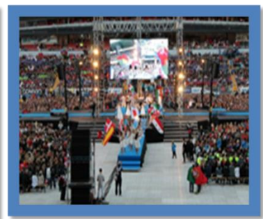
Gothia Cup Opening Ceremony

For more information about the tournament including age groups, rules and regulations and touristic/sightseeing information please visit the tournament website: www.gothiacup.se .