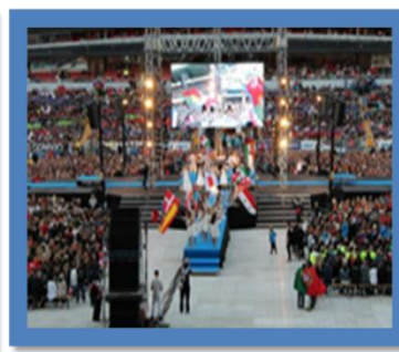
Gothia Cup Opening Ceremony

For more information about the tournament including age groups, rules and regulations and touristic/sightseeing information please visit the tournament website: www.gothiacup.se .