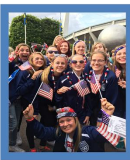
Norco Soccer Club