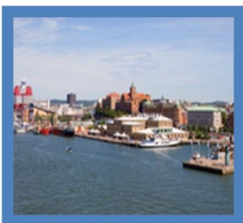
City of Gothenburg