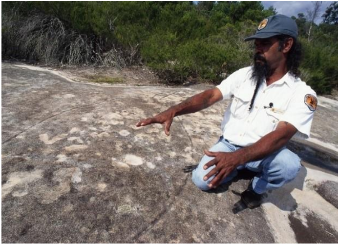
National Park Ranger

After breakfast, we will take a 10 walk to the local Ferry Station and catch the Ferry to Bundeena, a small village in the Royal National Park. On arrival, you will be met by one of the Park's Aboriginal Rangers. You will take a coastal walk lead by the National Park Ranger who will tell you about the Aboriginal history of the area, Dreamtime and show you aboriginal carvings which are thousands of years old. In the late afternoon, transfer back to Cronulla, to prepare for your first game of the Tour. From the city, transfer to the WWC game Semi Final at Sydney Football Stadium.