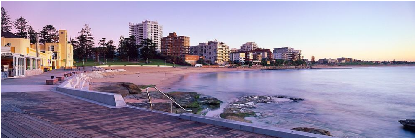
Cronulla Beach walk