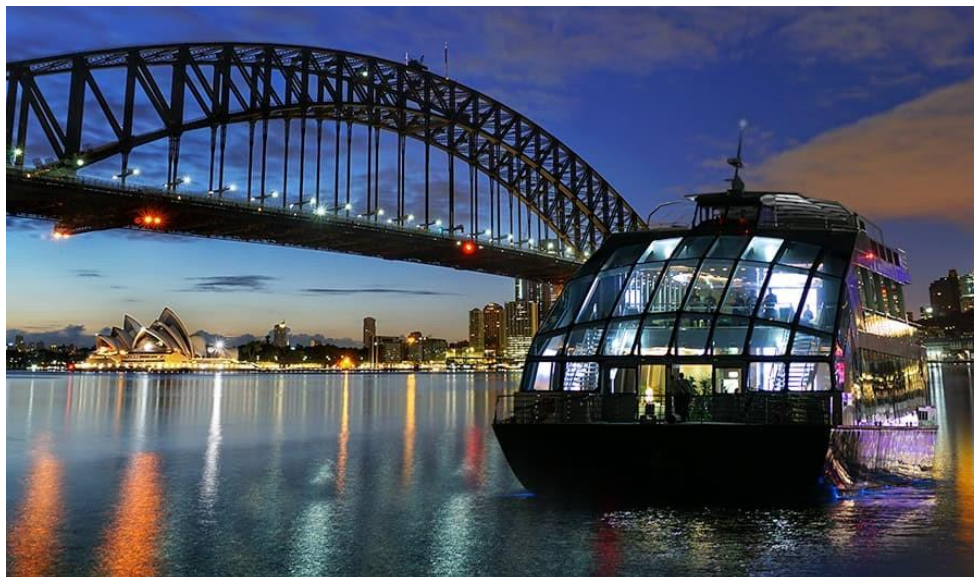
Sydney Harbor Cruise

The morning will be at leisure in Cronulla, as you prepare for your third and final game v suitable local opposition. In the evening, enjoy a spectacular Sydney Harbor Boat Cruise/Farewell dinner (Group price will be confirmed August 2022).