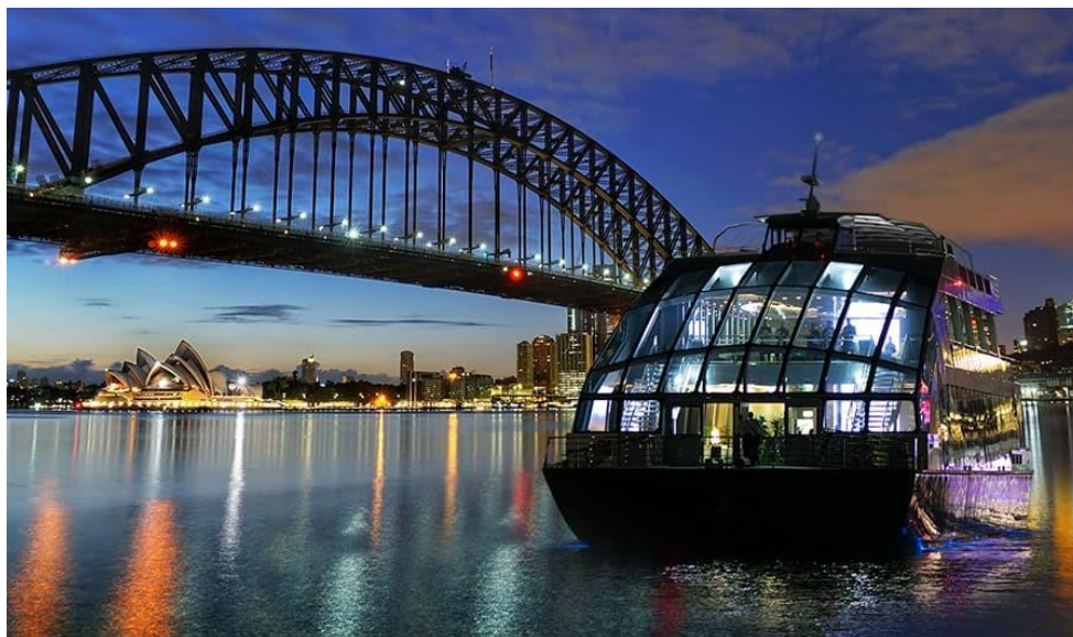
Sydney Harbor Cruise

The morning will be at leisure in Cronulla, as you prepare for your third and final game v suitable local opposition. In the evening, enjoy a spectacular Sydney Harbor Boat Cruise/Farewell dinner (Group price will be confirmed August 2022).