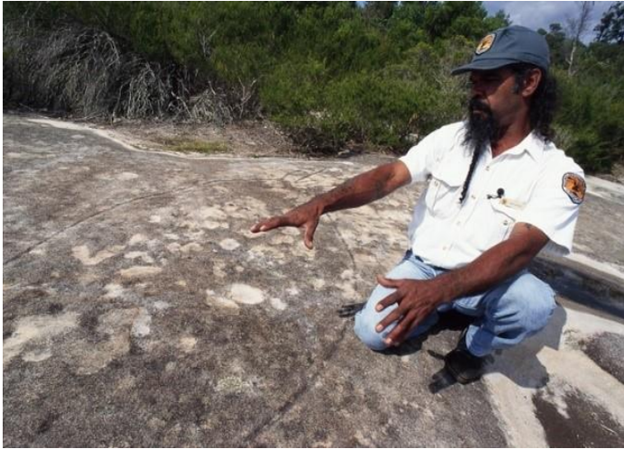
National Park Ranger

After breakfast, we will take a 10 walk to the local Ferry Station and catch the Ferry to Bundeena, a small village in the Royal National Park. On arrival, you will be met by one of the Park's Aboriginal Rangers. You will take a coastal walk lead by the National Park Ranger who will tell you about the Aboriginal history of the area, Dreamtime and show you aboriginal carvings which are thousands of years old. In the late afternoon, transfer back to Cronulla, to prepare for your first game of the Tour. Evening game vs. a local team.