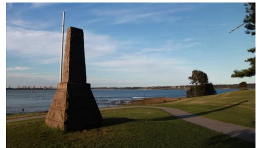
Captain Hook Landing Place

Arrive Sydney, transfer to your accommodation depending on room availability. You will either, check into the Hotel, freshen up, before we visit Captain Cooks landing place. (He discovered Australia) There are many local cafes in Cronulla, where lunch can be purchased. In the afternoon, walk the Esplanade to Bass and Flinders Point. If the weather is inclement, we will take the local train to Miranda (1approx. 5 minutes away from Cronulla) for some shopping.