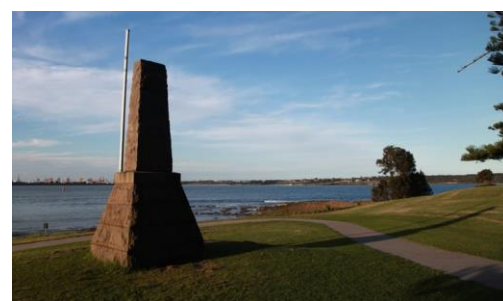
Captain Hook Landing Place

Arrive Sydney, transfer to your accommodation depending on room availability. You will either, check into the Hotel, freshen up, before we visit Captain Cooks landing place. (He discovered Australia) There are many local cafes in Cronulla, where lunch can be purchased. In the afternoon, walk the Esplanade to Bass and Flinders Point. If the weather is inclement, we will take the local train to Miranda (6approx. 5 minutes away from Cronulla) for some shopping.