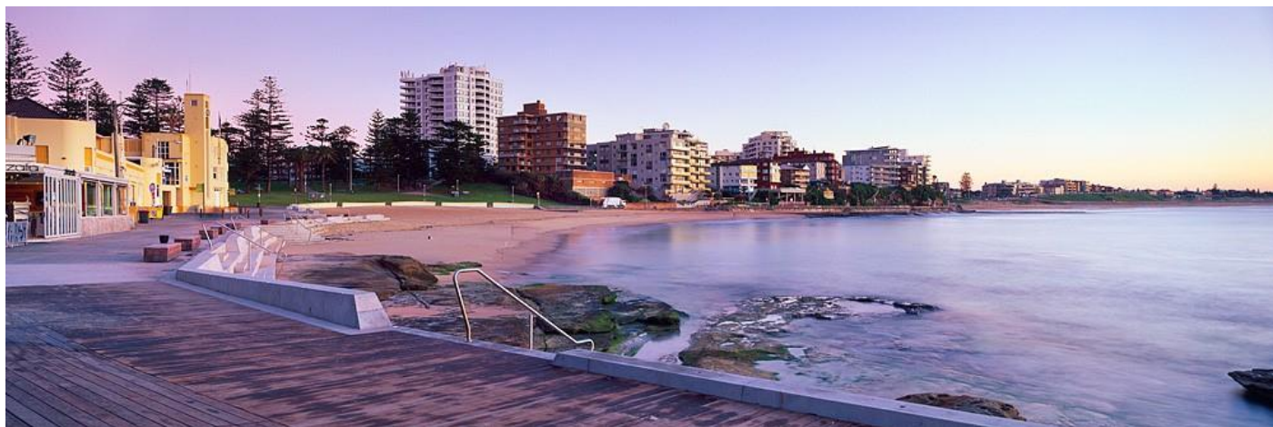
Cronulla Beach walk