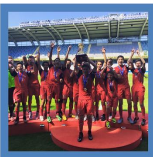
Dallas Texans Soccer Club

For more information about the tournament including age groups, rules and regulations and touristic/sightseeing information please visit the tournament website here .