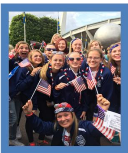
Norco Soccer Club