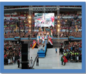
Gothia Cup Opening Ceremony