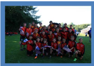
Dallas Texans Boys