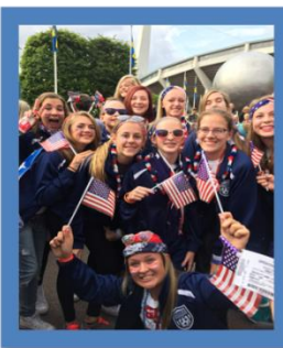
Norco Soccer Club