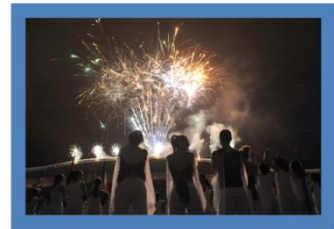
Donosti Cup Opening Ceremony