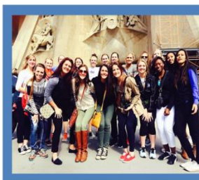
University of Mary