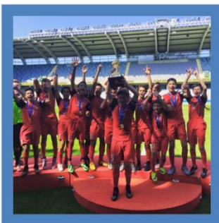
Dallas Texans Soccer Club