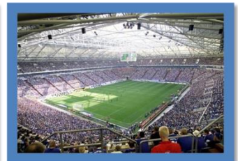
Allianz Arena Home of Bayern Munich