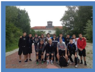
Putnam City North High School