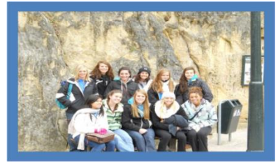
Northern State University