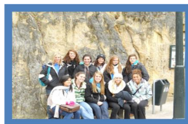
Northern State University