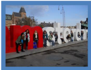
Northern State University