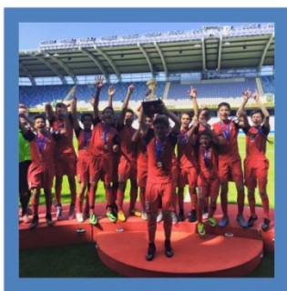
Dallas Texans Soccer Club