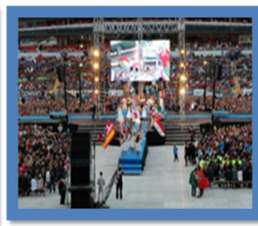
Gothia Cup Opening Ceremony

For more information about the tournament including age groups, rules and regulations and touristic/sightseeing information please visit the tournament website: www.gothiacup.se .