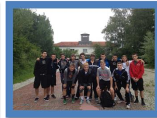
Putnam City North High School