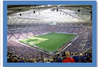
Allianz Arena Home of Bayern Munich