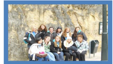
Northern State University

*The above itinerary is a provisional/suggested itinerary and can/will change depending on your group's specific wishes, the final game schedule for your team(s) and any pro game visit(s) incorporated for your group. Sightseeing admission fees are not included in the prices but can be added and pre-booked based on your group's specific wishes. Consult us for more information.