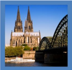
City of Cologne