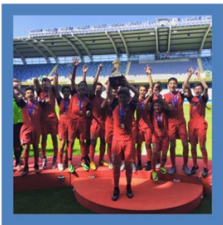
Dallas Texans Soccer Club