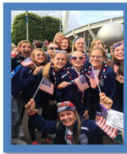
Norco Soccer Club