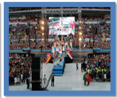
Gothia Cup Opening Ceremony