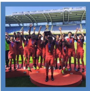
Dallas Texans Soccer Club

For more information about the tournament including age groups, rules and regulations and touristic/sightseeing information please visit the tournament website: www.gothiacup.se .