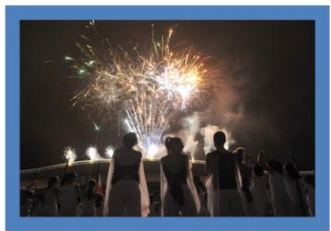
Donosti Cup Opening Ceremony