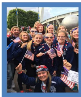
Norco Soccer Club