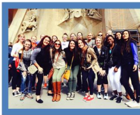
University of Mary