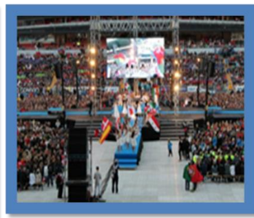
Gothia Cup Opening Ceremony

For more information about the tournament including age groups, rules and regulations and touristic/sightseeing information please visit the tournament website: www.gothiacup.se .