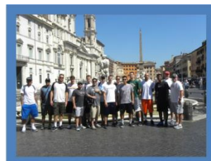
SCIAC All Stars

*The above itinerary is a provisional/suggested itinerary and can/will change depending on your group's specific wishes, the final game schedule for your team(s) and any pro game visit(s) incorporated for your group. Sightseeing admission fees are not included in the prices but can be added and pre-booked based on your group's specific wishes. Consult us for more information.