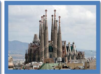
La Sagrada Família