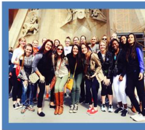
University of Mary