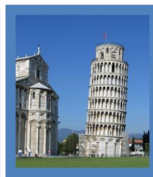
Leaning Tower of Pisa