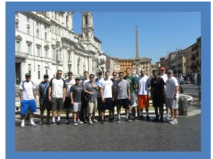
SCIAC All Stars

*The above itinerary is a provisional/suggested itinerary and can/will change depending on your group’s specific wishes, the final game schedule for your team(s) and any pro game visit(s) for your group. Sightseeing admission fees are not included in the prices but can be added and pre-booked based on your group’s specific wishes. Consult us for more information.