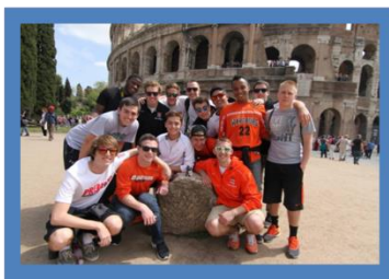
Wartburg College Men's Soccer