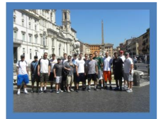
SCIAC All Stars

The Roman Forum: The Roman Forum is a rectangular forum (plaza) surrounded by the ruins of several important ancient government buildings at the center of the city of Rome. Citizens of the ancient city referred to this space, originally a marketplace, as the Forum Magnum, or simply the Forum. Located in the small valley between the Palatine and Capitoline Hills, the Forum today is a sprawling ruin of architectural fragments and intermittent archaeological excavations attracting 4.5 million sightseers each year.