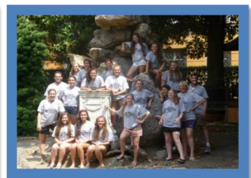
Lake Hill Storm SC