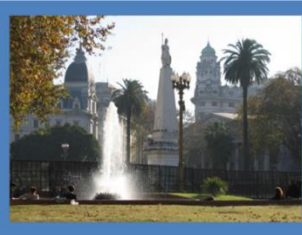
Plaza de Mayo