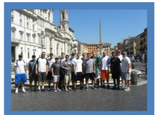
SCIAC All Stars

*The above itinerary is a provisional/suggested itinerary and can/will change depending on your group's specific wishes, the final game schedule for your team(s) and any pro game visit(s) incorporated for your group. Sightseeing admission fees are not included in the prices but can be added and pre-booked based on your group's specific wishes. Consult us for more information.