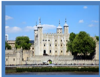
Tower of London