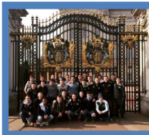
Wisconsin Lutheran College