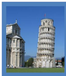
Leaning Tower of Pisa