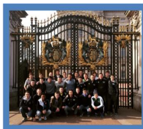
Wisconsin Lutheran College