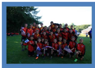
Dallas Texans Boys