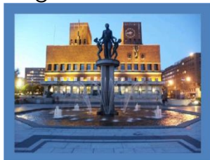
Oslo City Centre