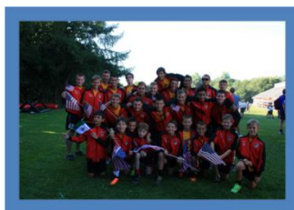
Dallas Texans Boys