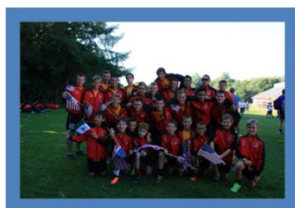
Dallas Texans Boys