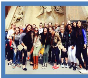
University of Mary