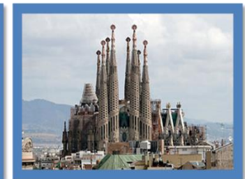
La Sagrada Familia