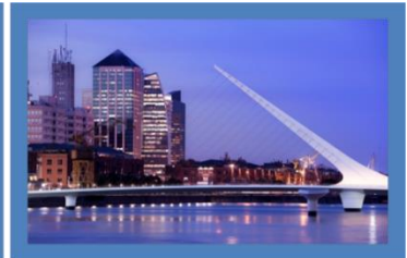
Buenos Aires Bridge