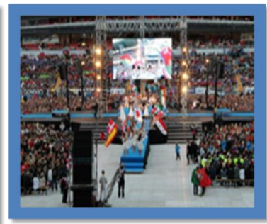
Gothia Cup Opening Ceremony

For more information about the tournament including age groups, rules and regulations and touristic/sightseeing information please visit the tournament website: www.gothiacup.se .