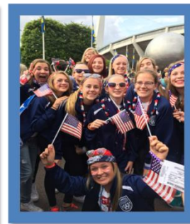
Norco Soccer Club