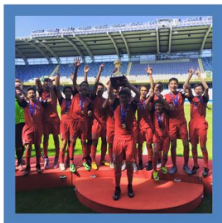
Dallas Texans Soccer Club