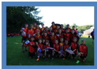
Dallas Texans Boys