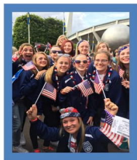
Norco Soccer Club