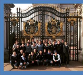
Wisconsin Lutheran College