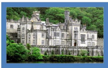
Galway Kylemore Abbey