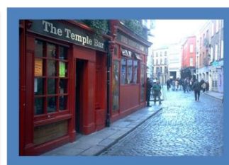
Streets of Dublin