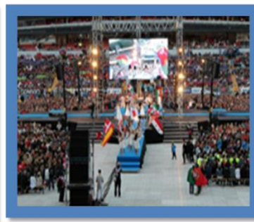
Gothia Cup Opening Ceremony

For more information about the tournament including age groups, rules and regulations and touristic/sightseeing information please visit the tournament website: www.gothiacup.se .