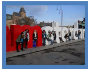
Northern State University