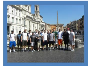
SCIAC All Stars

The Roman Forum: The Roman Forum is a rectangular forum (plaza) surrounded by the ruins of several important ancient government buildings at the center of the city of Rome. Citizens of the ancient city referred to this space, originally a marketplace, as the Forum Magnum, or simply the Forum. Located in the small valley between the Palatine and Capitoline Hills, the Forum today is a sprawling ruin of architectural fragments and intermittent archaeological excavations attracting 4.5 million sightseers each year.