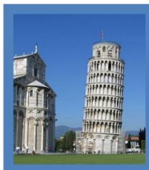
Leaning Tower of Pisa