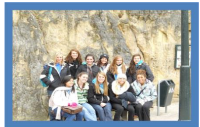
Northern State University

*The above itinerary is a provisional/suggested itinerary and can/will change depending on your group's specific wishes, the final game schedule for your team(s) and any pro game visit(s) incorporated for your group. Sightseeing admission fees are not included in the prices but can be added and pre-booked based on your group's specific wishes. Consult us for more information.