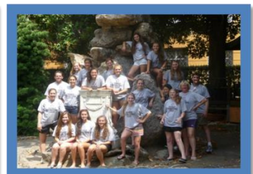
Lake Hill Storm SC