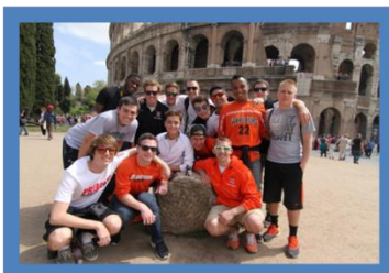
Wartburg College Men's Soccer