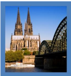
City of Cologne