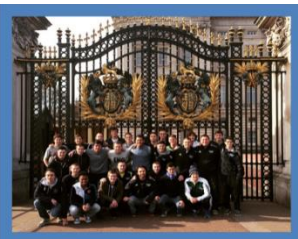
Wisconsin Lutheran College