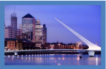
Buenos Aires Bridge