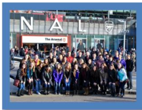
Arsenal Game Albion College

HAMPTON COURT PALACE: Hampton Court Palace is a royal palace in the London Borough of Richmond upon Thames, Greater London, in the historic county of Middlesex; it has not been inhabited by the British Royal Family since the 18th century.