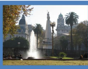
Plaza de Mayo