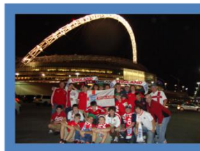
Glenn Falls High School