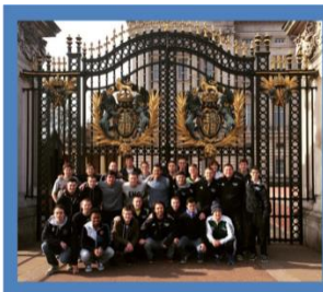
Wisconsin Lutheran College